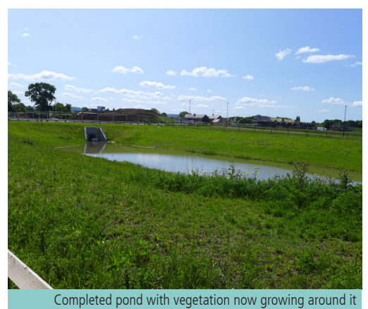
Completed pond with vegetation now growing around it