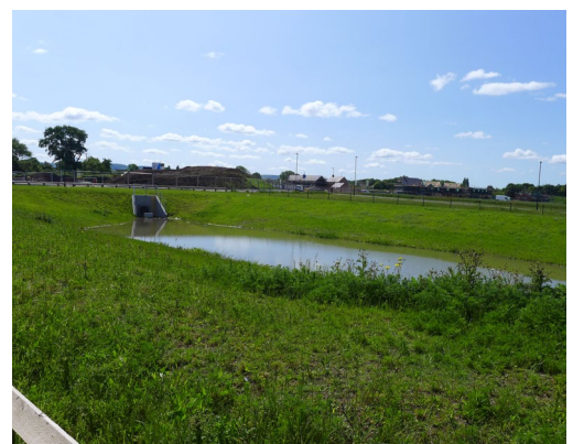
Completed pond with vegetation now growing around it