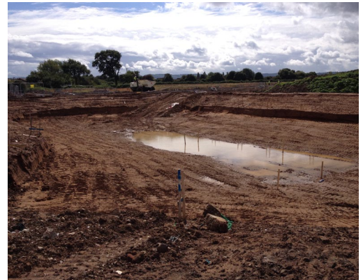
Site preparation before installation of the 1mm LLDPE